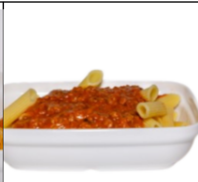
Gluten Free Pasta Bolognese