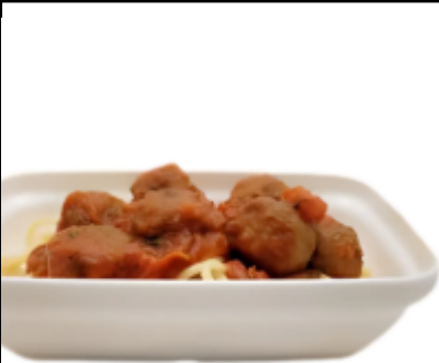
Spicy Meatballs on Pasta