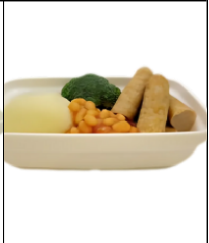
Bangers and Mash with Beans