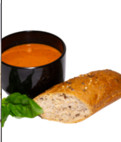
Tomato & Basil Soup & Brown Roll