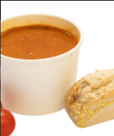
Tomato and Basil Soup & Gluten Free Roll