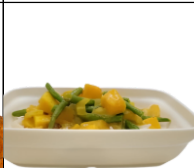
Butternut Korma on Rice