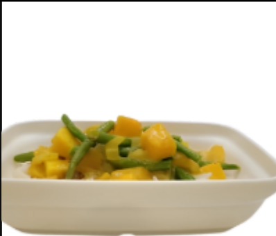
Butternut Korma on Rice