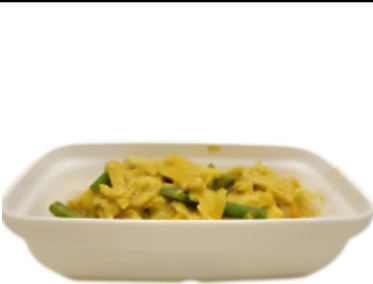
Chicken Korma on Rice