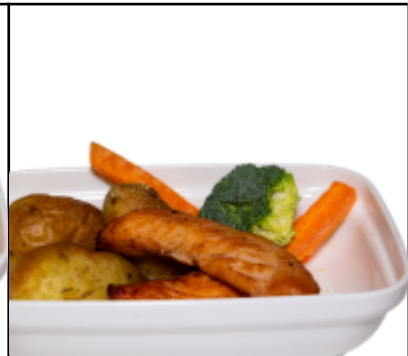
Chargrilled Mini Chicken Fillet, Roasted Baby Potatoes, Veg