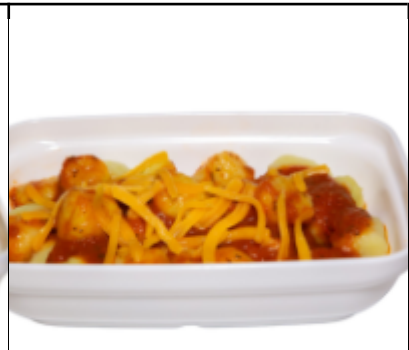
Gnocchi al Pomodoro