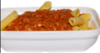
Gluten Free Spaghetti Bolognese