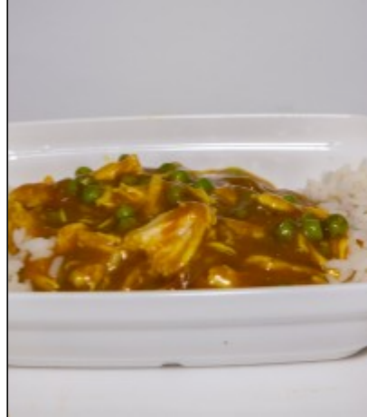
Chicken Curry on Rice