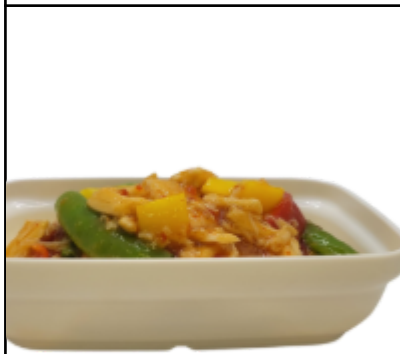
Sweet Chilli Chicken Noodles