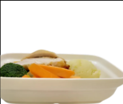
Roast Chicken with Mash and Veg