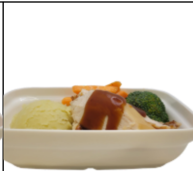
Roast Chicken with Mash, Veg & Gravy