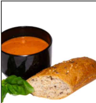
Tomato and Basil Soup & Brown Roll