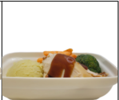
Roast Chicken with Mash, Veg & Gravy