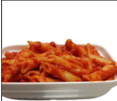
Gluten Free Pasta Basilico