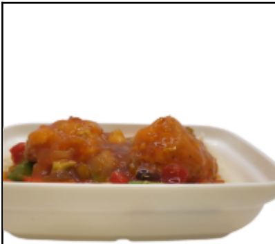
Sweet and Sour Chicken Chunks on Rice