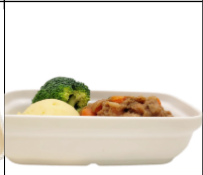
Beef Stew with Mash & Veg