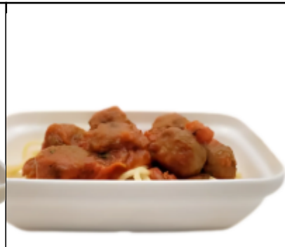
Spicy Meatballs on Pasta