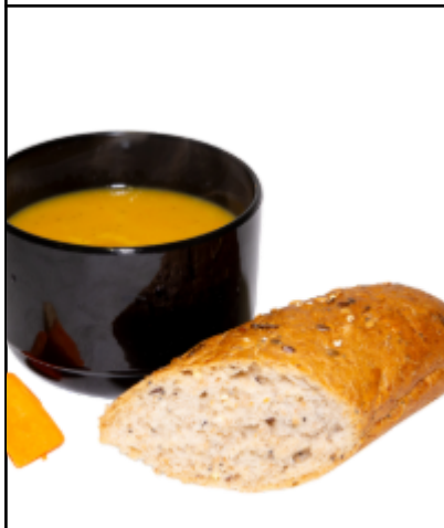
Cream of Vegetable Soup & Brown Roll