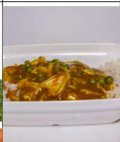
Chicken curry on rice