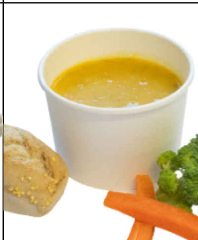
Cream of Vegetable Soup & Gluten Free Roll