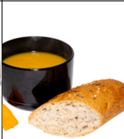
Cream of Vegetable Soup & Brown Roll