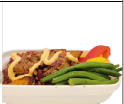
Mexican Chilli Beef Wedges