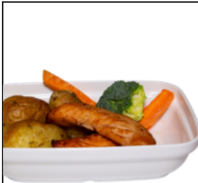
Chargrilled Mini Chicken Fillet, Roasted Baby Potatoes & Veg