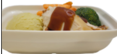
Roast Chicken with Mash, Veg and Gravy