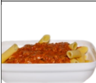
Beef Bolognese on Pasta Spirals