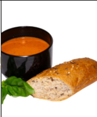
Tomato and Basil Soup & Brown Roll