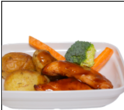
Chargrilled Mini Chicken Fillet, Roasted Baby Potatoes, Veg, Gravy