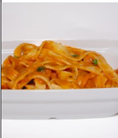
Tagliatelle with Tomato and Mascarpone