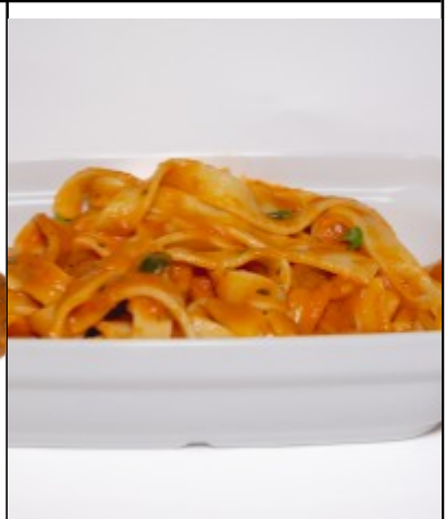
Tagliatelle with Tomato and Mascarpone