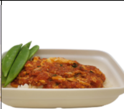
Firecracker Chicken on Rice