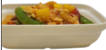
Sweet Chilli Chicken Noodles