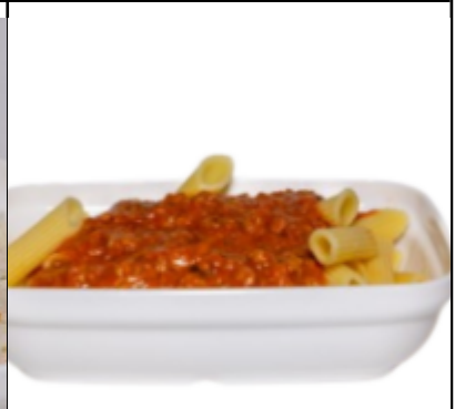
Gluten Free Pasta Bolognese