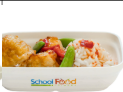
Sweet Chilli Chicken Chunks on Rice