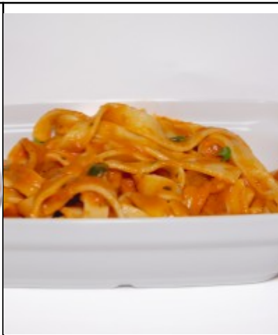
Tagliatelle with Tomato & Mascarpone