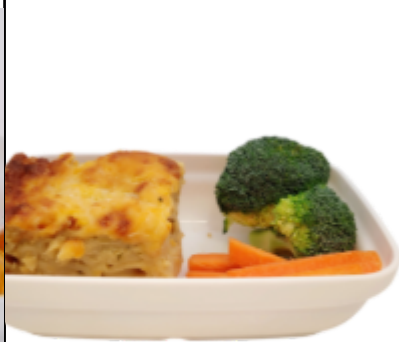
Macaroni and Cheese