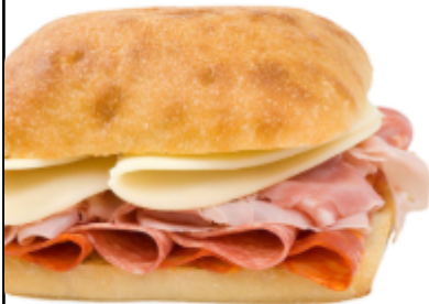
Italian Job Ciabatta