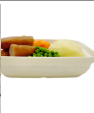
Bangers and Mash with Peas and Carrots