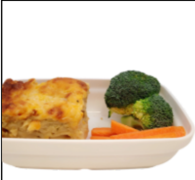
Macaroni & Cheese