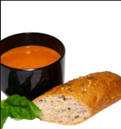
Tomato and Basil Soup & Brown Roll