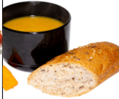
Cream of Vegetable Soup & Brown Roll