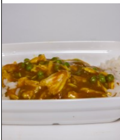
Chicken curry on rice