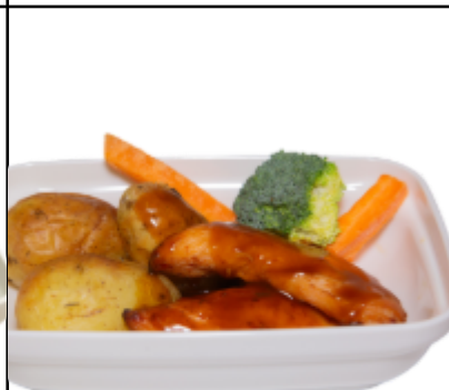
Chargrilled Mini Chicken Fillet, Roasted Baby Potatoes, Veg & Gravy