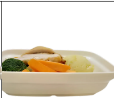
Roast Chicken with Mash & Veg