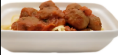
Italian Meatballs on Spaghetti