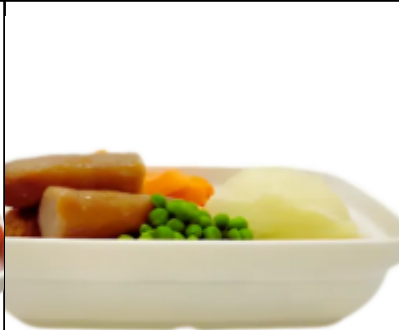
Bangers and Mash with Peas & Carrots