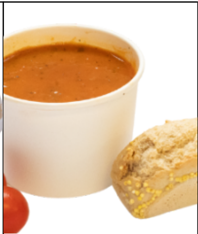
Tomato and Basil Soup & Gluten Free Roll