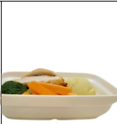
Roast Chicken with Mash & Veg