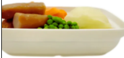
Vegetarian Bangers and Mash with Veg