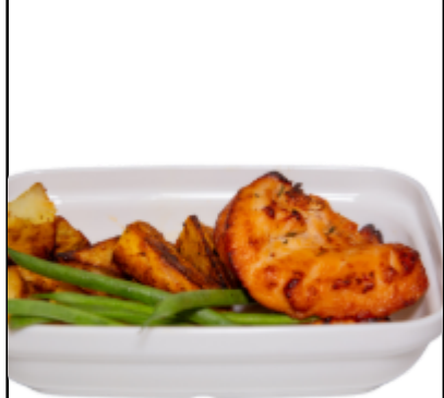
Chargrilled Mini Chicken Fillet with Spicy Potato Chunks & Green Beans