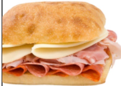
Chicken Ciabatta Melt