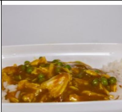
Chicken Curry on Rice