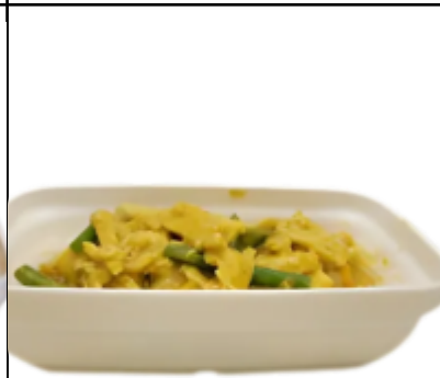
Chicken Korma on Rice