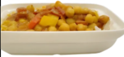
Chickpea Curry on Rice