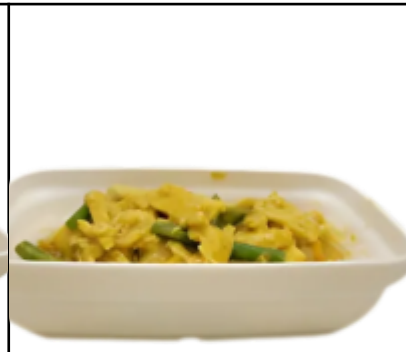
Chicken Korma on Rice