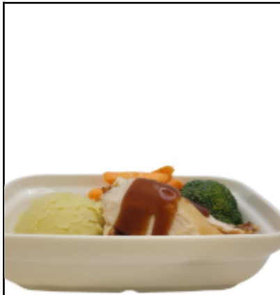
Roast Chicken with Mash, Veg & Gravy