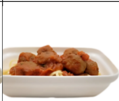
Spicy Meatballs on Pasta