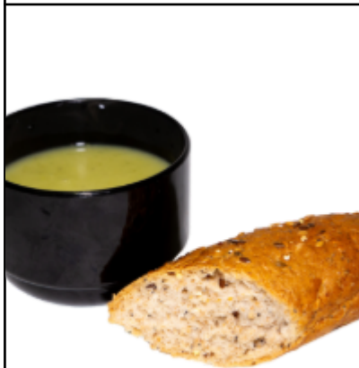
Leek & Potato Soup with Brown Roll