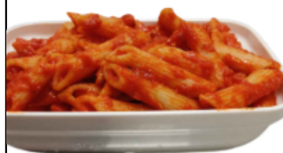
Gluten Free Pasta Basilico